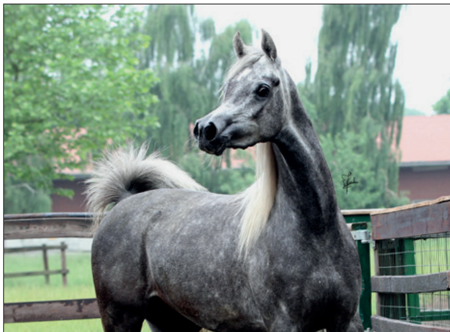
NK Nachita (NK Nadeer x NK Bint Bint Nashua)

or Arabian horse breeding, this is a well-known fact.