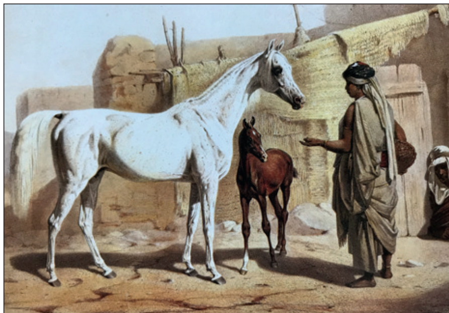
Theodor Horschelt, Arabian mare. City Museum, Munich

spaces and lots of things have changed. Many state studs were closed or it was allowed to convert them into museums of all sorts. Small private breeding enterprises cropped up. Riding turned into a hobby. What connects the different worlds of horses and their owners today is a kind of world religion that provides the space for an enormously wide field of interest, such as sports, representation, or economy. In addition, advanced reproduction technologies evolved, and were not only applied by the state studs for their stallions, but even by private small breeders.