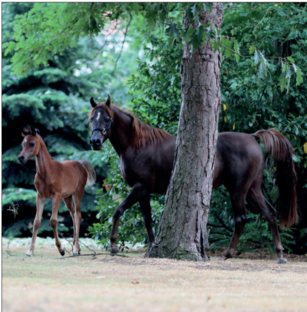
NK Larissa (NK Hafid Jamil x NK Lateefa) with filly NK Leilah, sired by NK Nizam