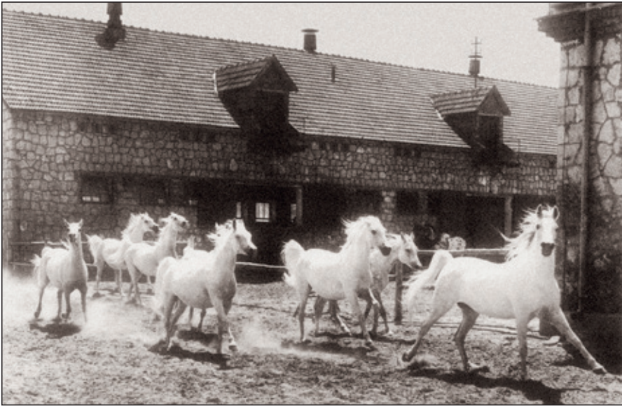
"In Polish breeding, the dam lines have an overwhelming importance" (H.J. Nagel)