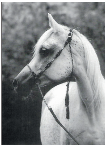
Messaouda-M is the dam of well-known stallions such as Maydan-Madbeen, Madbeen El Shah and Mishaal HP.