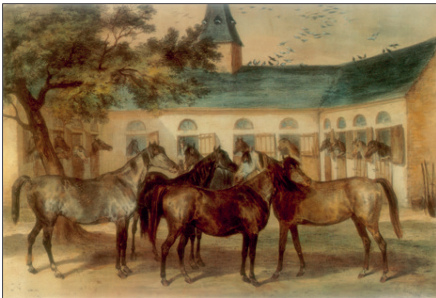
France: The brood mares at the state stud of Pompadour

These facts also need to be considered when a mare is expected to produce a good stallion. Mares who became known as „stallion producers“ can be assumed to have had dominant status in their herd, as well as pride and composure, so as to produce a self-confident colt. A shy colt growing up with his subordinate dam will hardly grow into the role of a breeding sire; the genetically implied and epigenetically consolidated behavior of a dominant stallion affects his body language, his gaits, his pride in his way of displaying himself. He will overcome his flight instinct when difficulties arise,