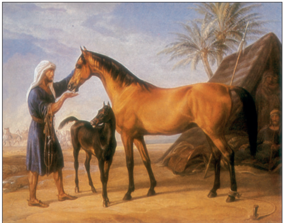
Albrecht Adam, Arabian mare and her foal, Oil painting (1845)

for the selection of stallions and specified the criteria to be used. Functionality was considered more important for the selection than Arabian type, as all horses were intended to be ridden later on. The wind of the legendary old cavalry was still blowing through the barns and training centers for riders and breeders. Private studs used the state-run stallion stations without having to stable stallions of their own. Today, however, almost a hundred years later, riding horses as a means of transportation have vanished from public