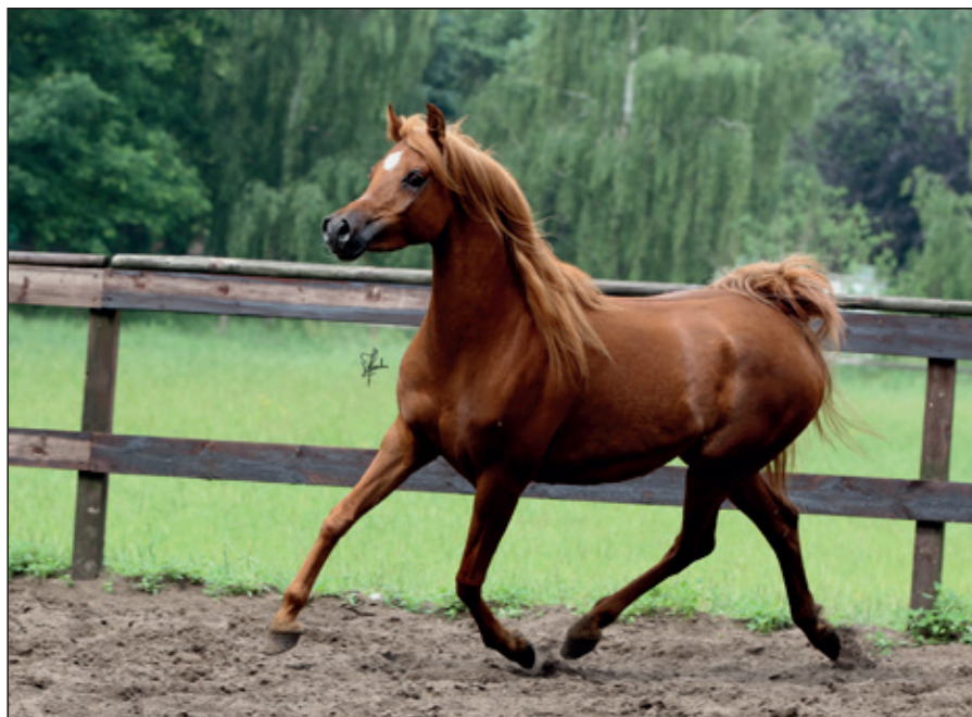
NK Lina (NK Kamar El Dine x Muneera Al Ariba), dam of NK Lotfy and NK Lam El Dine