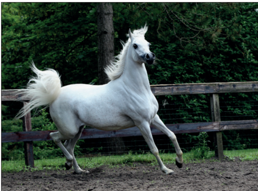
NK Nadirah (Adnan x Nashua). She is the dam of NK Nadeer and NK Nizam, two cornerstones in the NK breeding concept

These prerequisites are easier to achieve, for sure, when there is a stud with a breeding population composed of a few families only, whose quality and traits are sufficiently well known from long years of breeding with them. In this case, the prerequisite of a bloodline nick - be it more close or more wide - is easiest and most conveniently met.