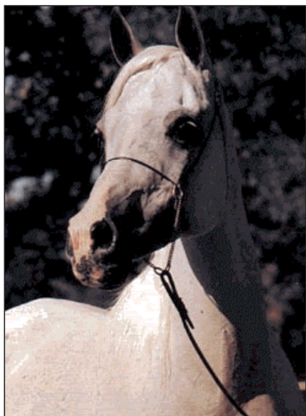
Bint Magidaa had a brilliant career as a stallion producer. Her world-famous three sons Ruminaja Ali, Ruminaja Bahjat and Alidaar, were all sired by Sheikh Al Badi