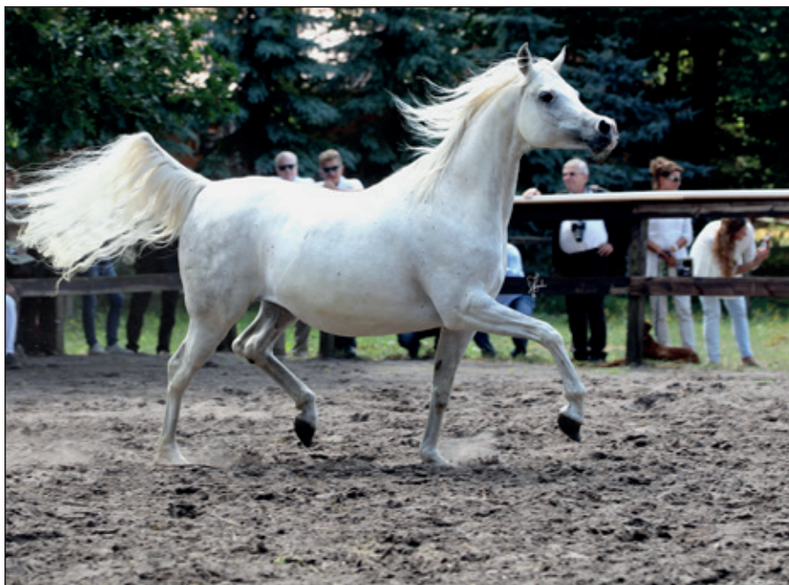
NK Abba (NK Jamal El Dine x NK Aziza), dam of NK Anwar